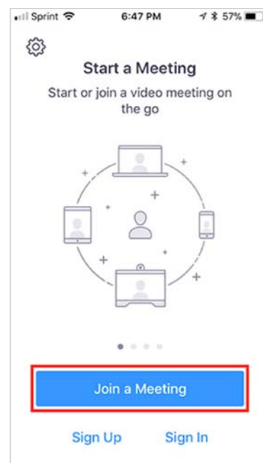
Figure 2: First screen when you open the Zoom app

4. Tap on your Zoom app to open it. The screen to the right will be the first thing you see. Tap 'Join a Meeting' if you want to join without signing in.