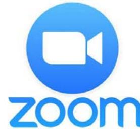
Figure 1: 'Zoom app' icon

1. Please refer to our How to Download an App guide and follow the instructions and download the Zoom mobile app onto your phone.