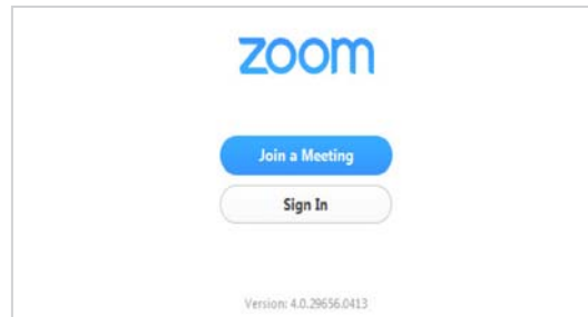
Figure 6: 'Join a Meeting' button

If there is a password you will be asked to enter it here.