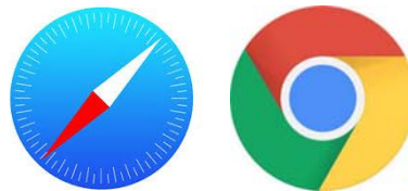
Figure 5: Examples of internet browser icons

8. Turn on your laptop and open the internet browser.