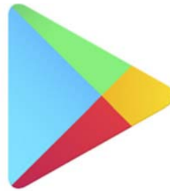
Figure 1: 'Google Play Store image'

You may need to sign into your Google account to access this if you have one. A Google account and a gmail account is the same thing, 'g' in gmail stands for Google. A gmail account is a brand of email (an electronic mail). You can find out how to create a gmail account from Age Action's How to...Create an Email guide.