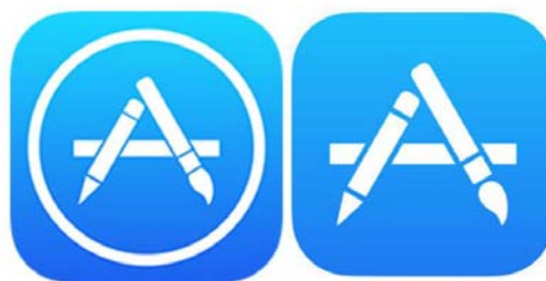
Figure 2: ‘App Store’

If you do not have an Apple ID, tap “Create ID” and follow instructions.